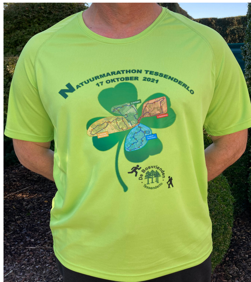
Mooie T-Schirt van de eerste editie ter illustratie